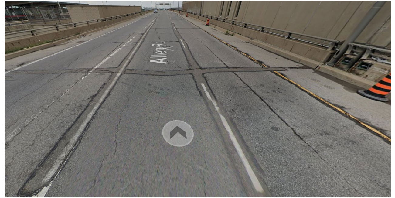
Allen Road Above Wilson Station Mezzanine Level Ceiling