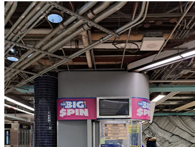
Mezzanine Level Ceiling