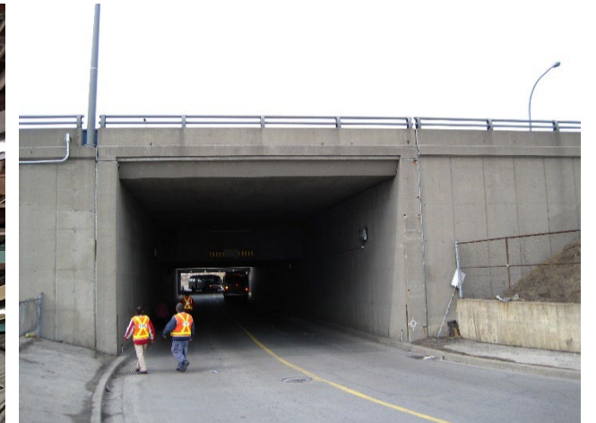
Wilson Station Bus Underpass