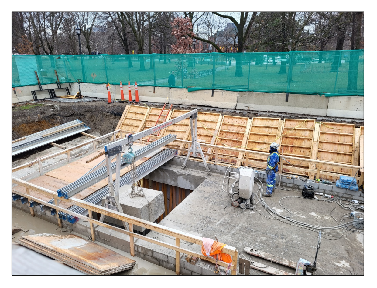
Cutting the tunnel roof at south end of Museum Station for the Second Exit/Entrance in Queen's Park Circle, looking west.

Construction of the staircase at the Second Exit/Entrance is ongoing.