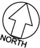
Attachment 1B Proposed New Entrance Concourse Level NOT TO SCALE