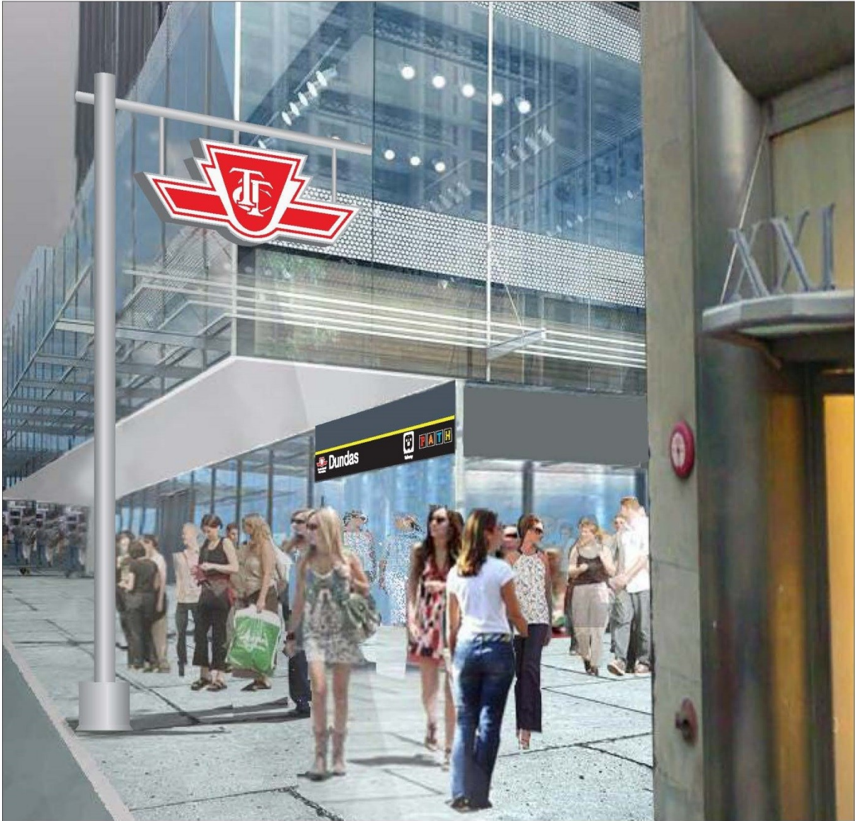
Dundas St. Entrance