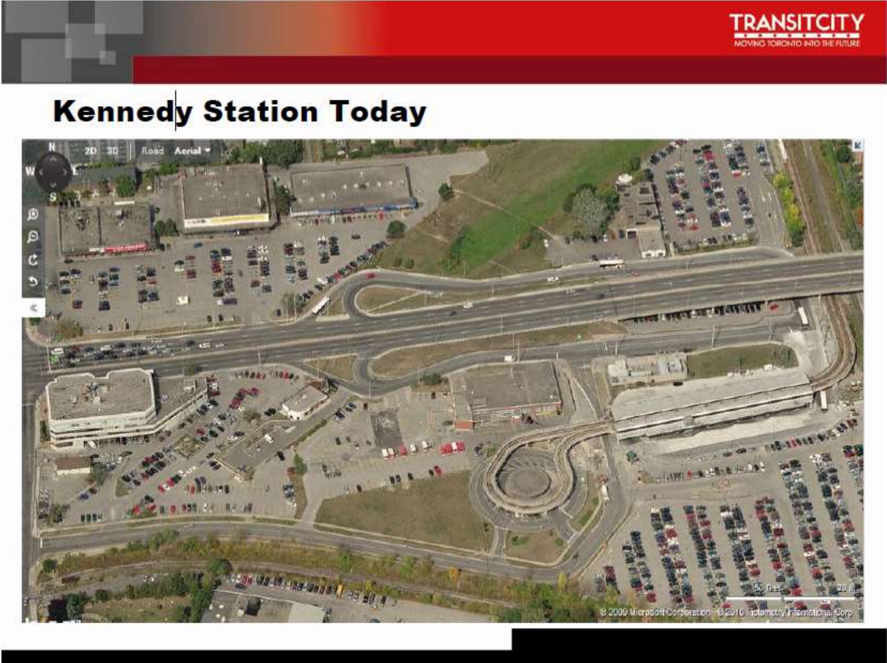
Figure 2: Kennedy Station Today