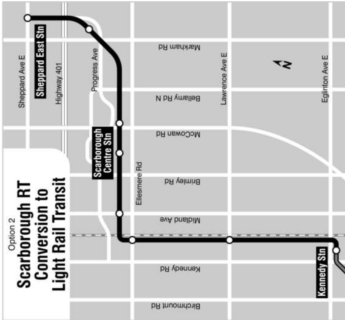
Figure 1: Scarborough RT Conversion to Light Rail Transit