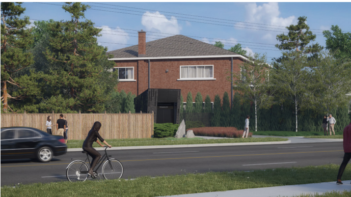
Emergency Exit Building on the west side of McCowan Road north of Hurley Crescent.