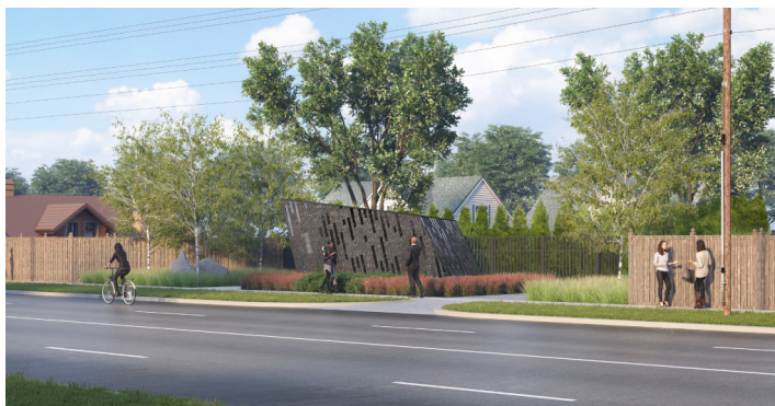
Emergency Exit Building on the west side of McCowan Road north of Meldazy Drive.