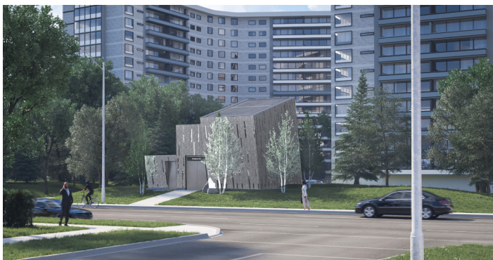
Emergency Exit Building on the west side of Danforth Road north of Savarin Street.