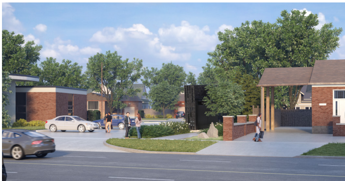
Emergency Exit Building on the east side of Danforth Road south of Hollyhedge Drive.

TTC社区会议欢迎家庭和行动不便人士参加。如需翻译或无障碍服务, 请联系Chris Joseph。