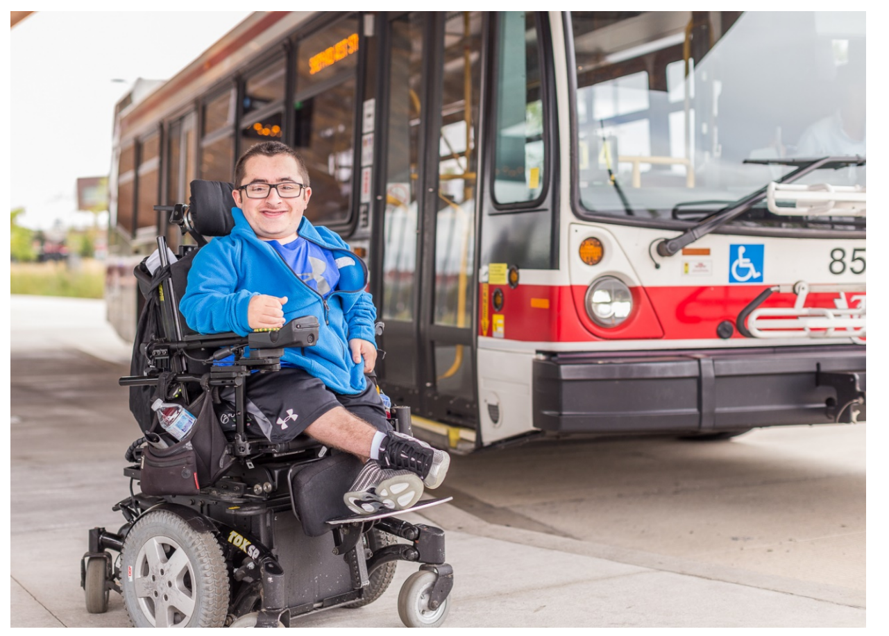
Wheel-Trans Customer using the Family of Services

A Family of Services trip connects Wheel-Trans customers to and from accessible conventional TTC (bus, streetcar, subway), allowing them ease of travel to reach their destination and return back home