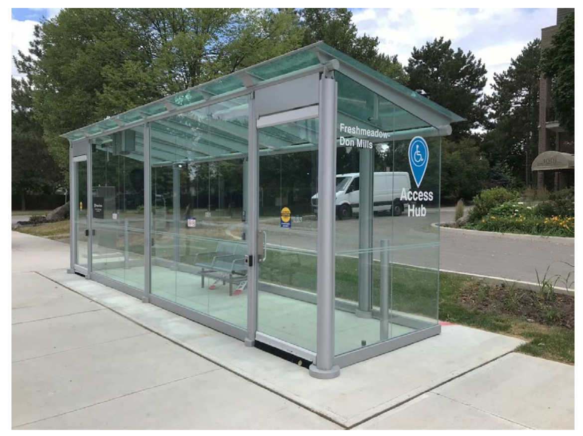
Freshmeadow and Don Mills Access Hub

*Overlea and Thorncliffe Access Hub is not yet in service due to pending hydro work.