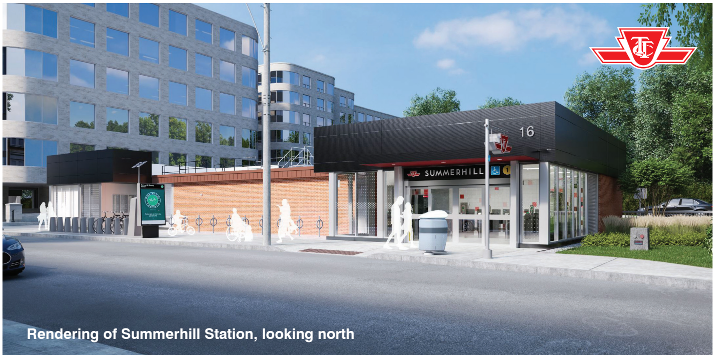
Rendering of Summerhill Station, looking north