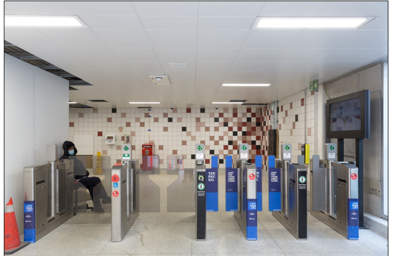
Picture- The fare gates by the new main entrance at Summerhill Station