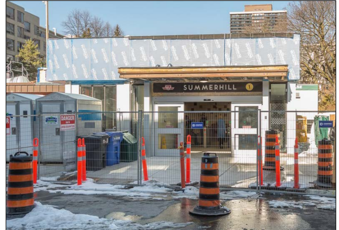
Picture- New main entrance at Summerhill Station