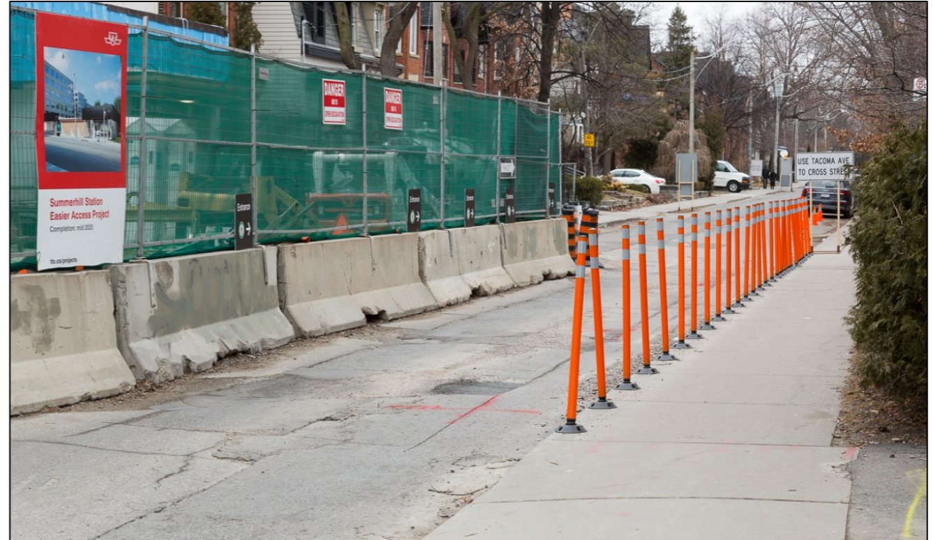
Picture- Outside the construction site on Shaftesbury Avenue