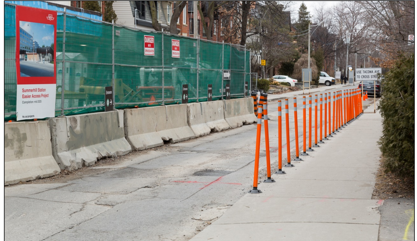
Picture- Outside the construction site on Shaftesbury Avenue