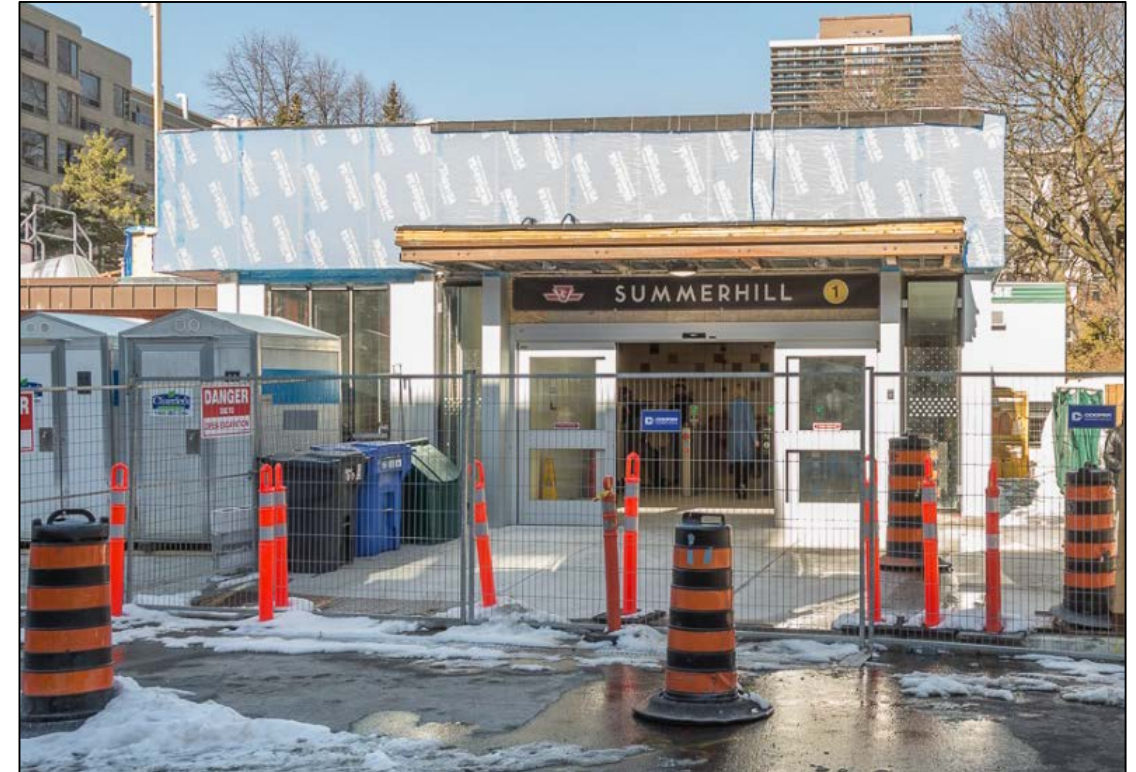
Picture- New main entrance at Summerhill Station