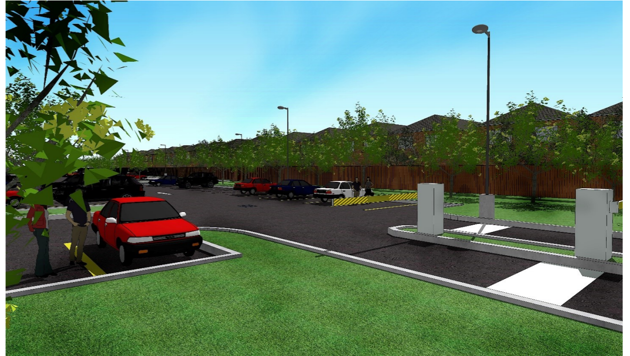
Rendering of new Mount Dennis Garage parking lot with security gate driveway entry. Looking west.