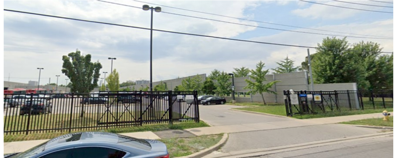
Current Mount Dennis Garage parking lot with noise wall. Noise wall to remain.