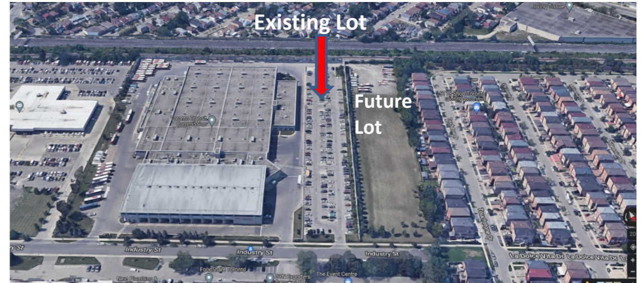
Mount Dennis Garage