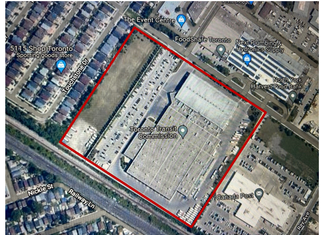
Aerial image of Mount Dennis Garage