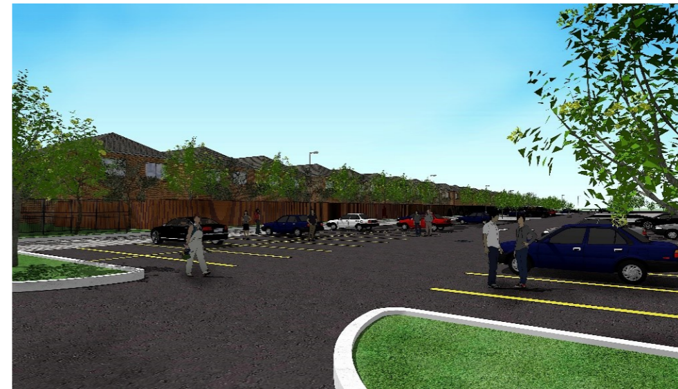
Rendering of new Mount Dennis Garage parking lot