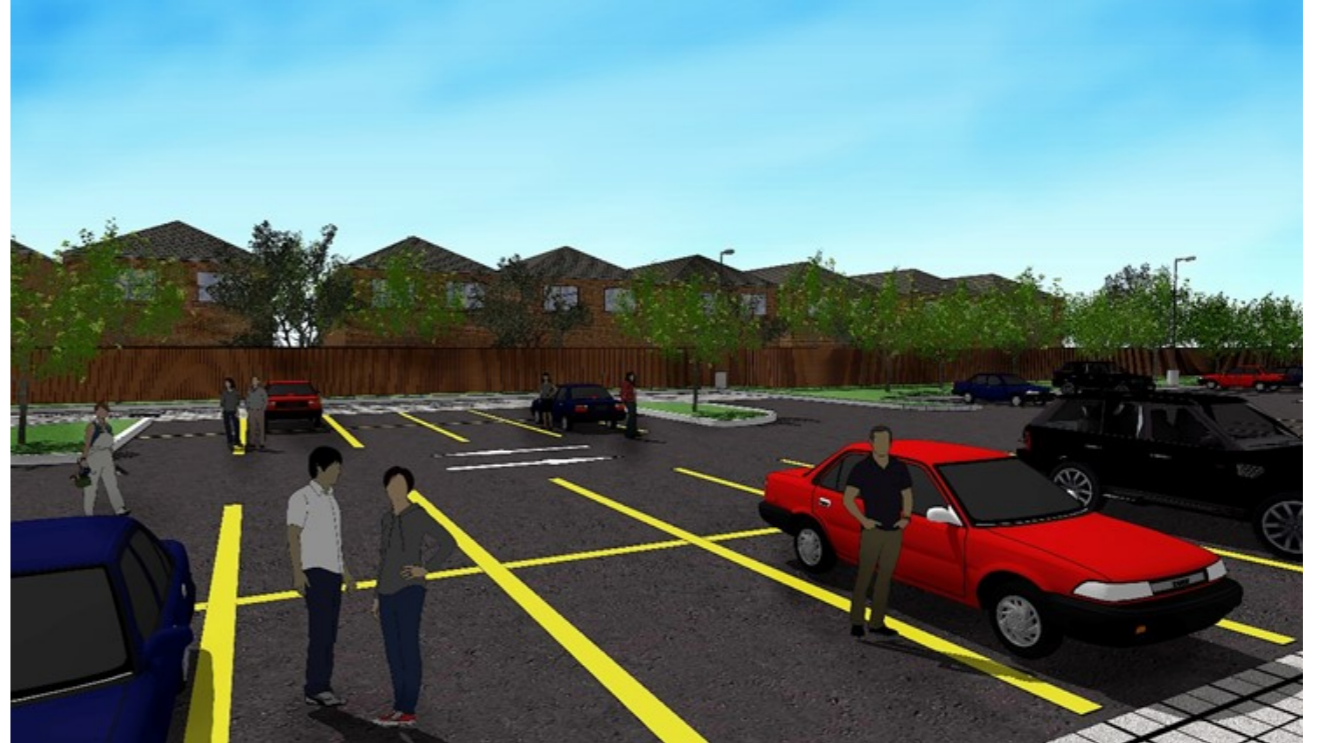
Image: Rendering of new Mount Dennis Garage parking lot with wooden fence barrier between the lot and homes. Looking west.